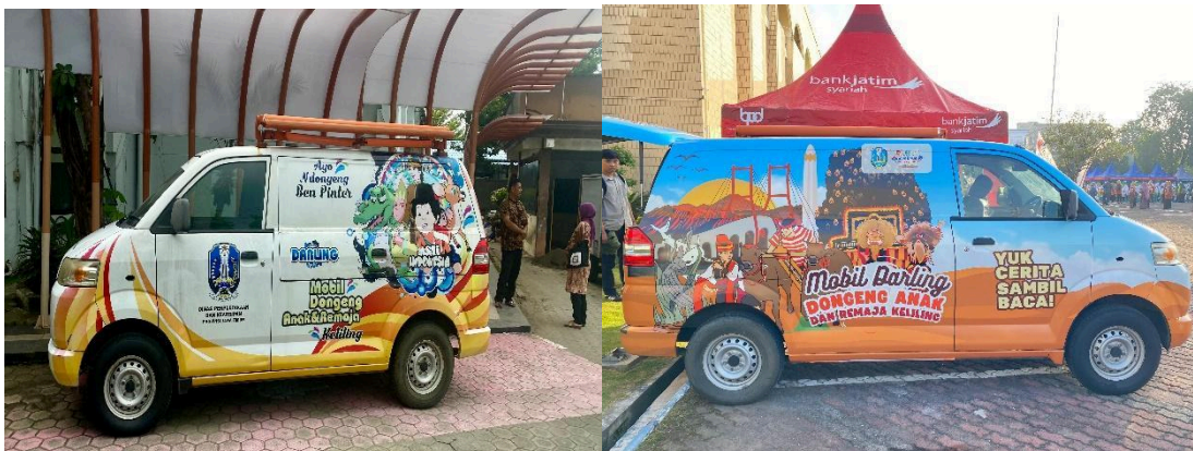
Figure 2. Darling Service Car Appearance Before & After Rebranding

Based on the results of interviews and observations that have been conducted, it can be seen that the East Java Provincial Library and Archives Service has tried to maintain and improve the quality of the tangible or physical aspects of the Darling program, this is evident in the efforts to improve and rebrand the Darling fleet. This rebranding is not only focused on the exterior appearance of the vehicle to make it more attractive, but also aims to create visual closeness with children and adolescents as the main targets of the program. With an attractive design, it is hoped that the Darling fleet can add and build interest in reading from an early age.