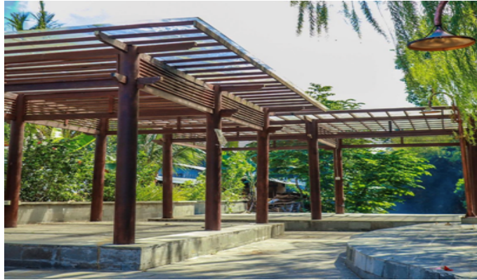
Figure 4. Potential as a Pre-Wedding Spot

Inside the Oongan Dampark there is an interesting spot that has the potential to be a pre wedding spot. The appearance of this spot can be seen in the following picture: