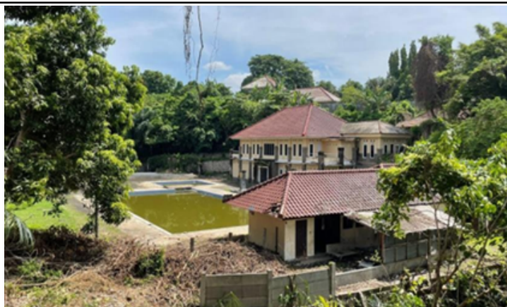
Figure 6. Oongan Dam Swimming Pool

The Oongan Dam swimming pool needs to be developed to meet national/international standards. Additionally, the area around the swimming pool should be developed to include a children's play area.