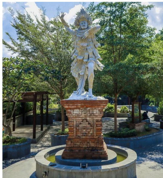
Figure 5. Potential as a Tourism Icon in Denpasar

In the center of the Dam Oongan park there is a unique statue of a god whose appearance can be seen in the following picture: