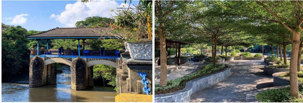
Figure 2. Oongan Dam and the Oongan Dam Park for Jogging and Shelter

The reorganization of the Oongan Dam area is regulated in Article 19, paragraph (7), letter i of Denpasar City Regulation No. 3 of 2019, which governs the Tourism Attraction Area (KDTW) of Peguyangan, including the Peguyangan Village area with the Oongan Dam tourist attraction in Tonja. As an implementation of this provision, the Oongan Dam located in Tonja Village, North Denpasar District, was reorganized by the Denpasar City Government from July 9 to December 5, 2019. The reorganization of the Oongan Dam into a tourist destination has been positively received by the local community, who believe that the transformation of the Oongan Dam into a tourism destination will bring various benefits to the surrounding community.